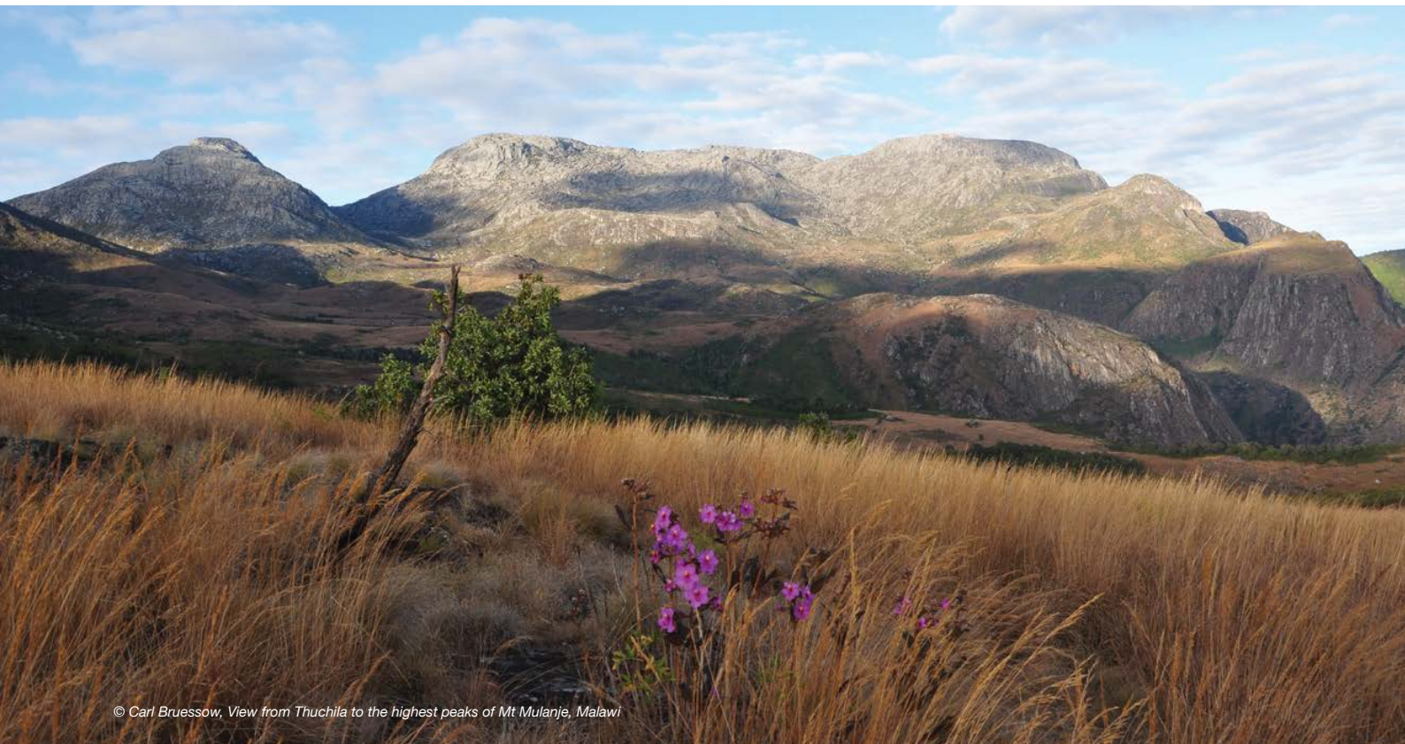
View from Thuchila to the highest peaks of Mt Mulanje, Malawi